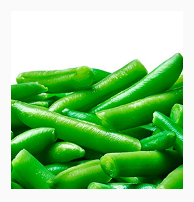
Certifications: HACCP Certified.

Cafes, restaurants, QSR, clubs, hotels, catering, hospitals, canteens and institutions.